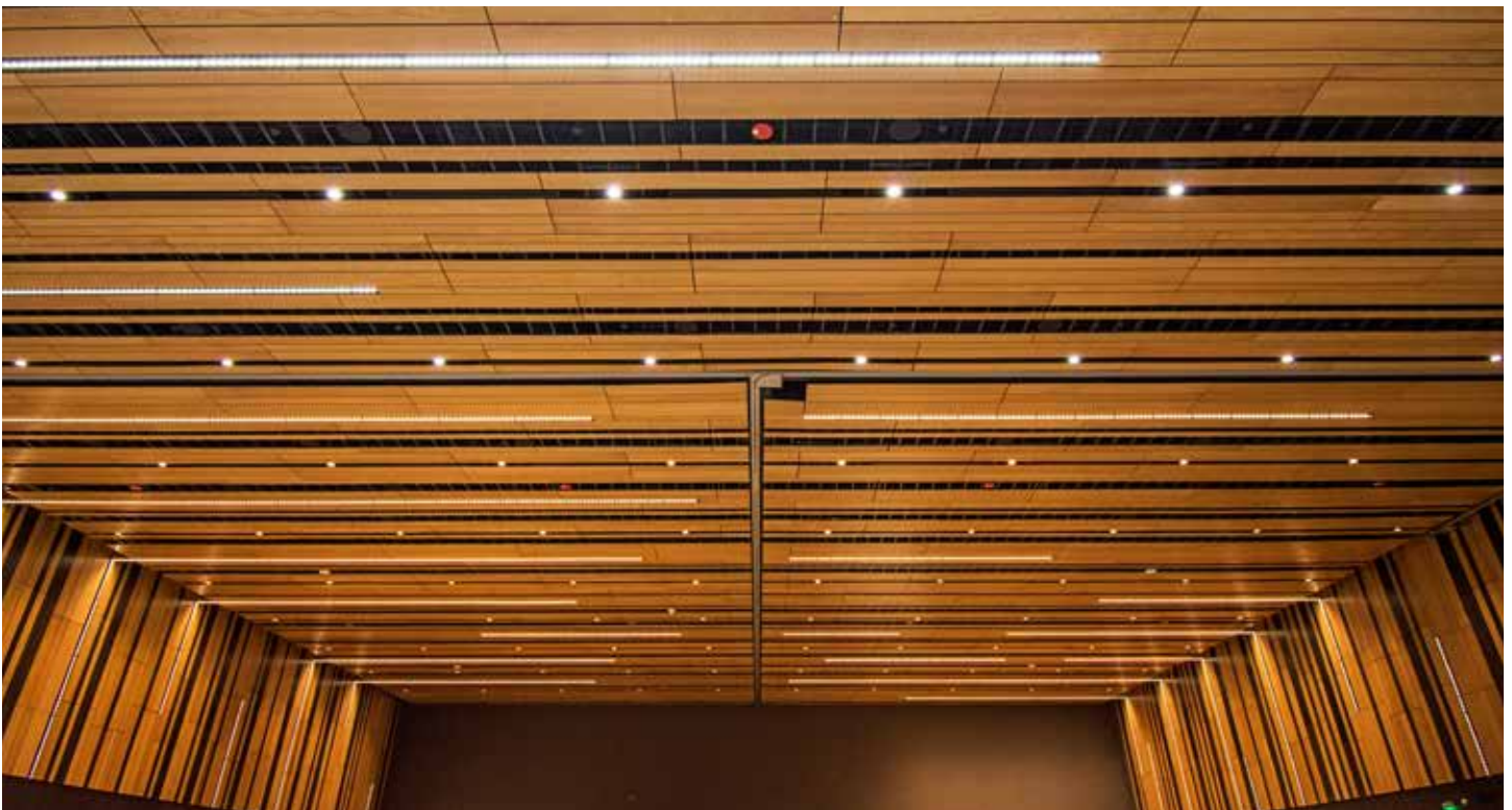
The ballroom at the Hyatt Regency Seattle features 17,860 sq. ft. of custom acoustic panelized linear ceilings and 6,752 sq. ft. of custom acoustic panelized linear walls.

Something new. For the ballroom, 9Wood combined SKUs from its wood ceilings product line to create something new—a panelized wood linear ceiling with acoustical properties. The panels feature wood members of various width